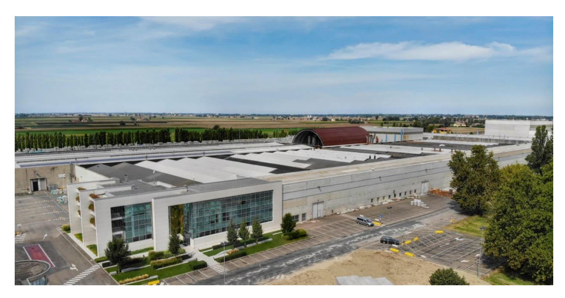
Finale Emilia Panariagroup Facilities: