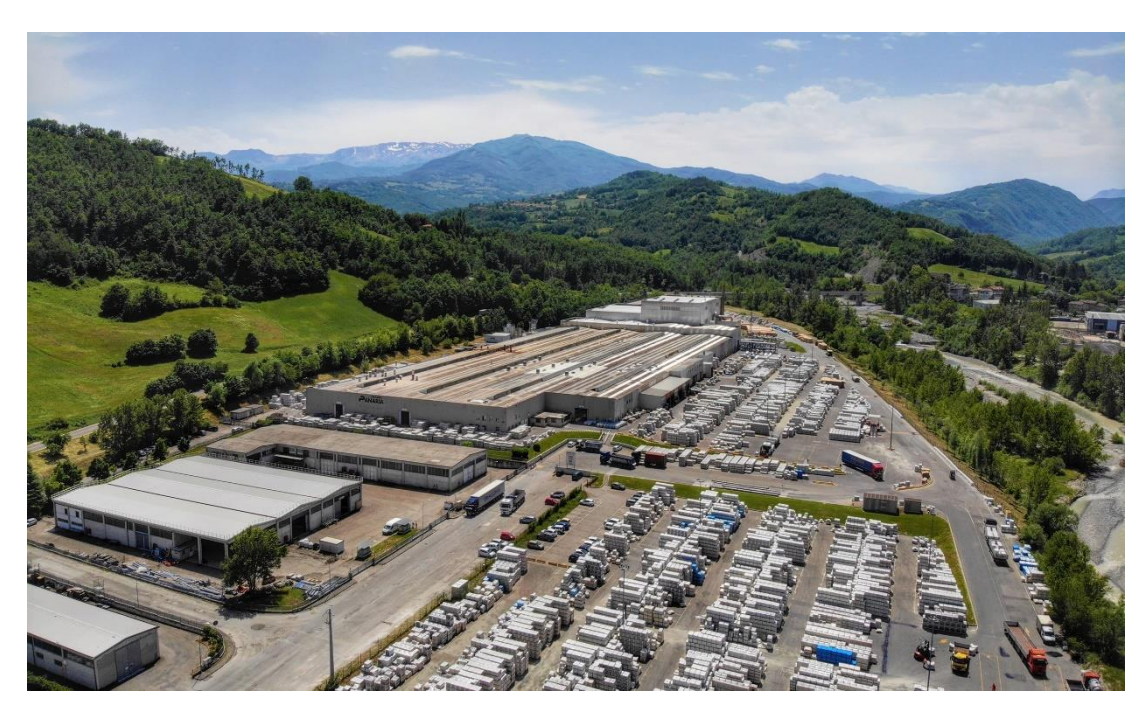
Toano Panariagroup Facilities, Fora di Cavola