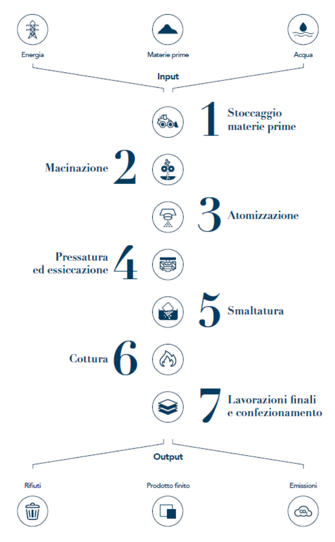
production process diagram

The pallets on which the boxes of finished product are placed are stored in a special parking area outside the factory. The product is then ready to be shipped, through to the customer. A radio frequency computer system was installed at the plant to manage the handling of finished products in the warehouse (using a new barcode label for pallet identification). This intervention allows greater control of the finished product warehouse and minimises shipping errors.